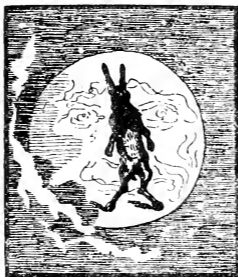
SÂKYAMUNI AS A HARE IN THE MOON.

formation of a learned and intelligent French gentleman recently arrived from Ceylon, who adds that the Cingalese would often request of him to permit them to look for the hare through his telescope, and exclaim in raptures that they saw it. It is remarkable that the Chinese represent the moon by a rabbit pounding rice in a mortar. Their mythological moon Jut-ho is figured by a beautiful young woman with a double sphere behind her head, and a rabbit at her feet. The period of this animal's gestation is thirty days; may it not therefore typify the moon's revolution round the earth." 79